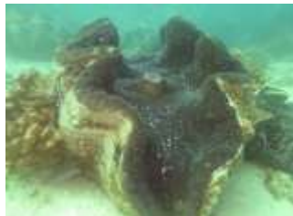
Philippine Giant Clam

Day 7 - Giant Clams This was a special day, we got to see giant clams. These critters were 6 ft. long, 3 ft. wide and rise 4 ft. off the bottom. They were brought into the area a few years ago. After visiting the clams, we went on a muck dive, we located a sea horse, and another large frog fish. Our dives around the clams were monitored by someone on shore. A few years back, a diver was harvesting the giant clam. He was arrested and convicted, and someone was monitoring all the diver activities from that point onward.